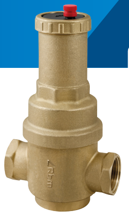
AIRTERM In-line deaerator

With their capacity to absorb air bubbles nestled in the system's critical areas, deaerators help guarantee system efficiency and are therefore considered safety devices