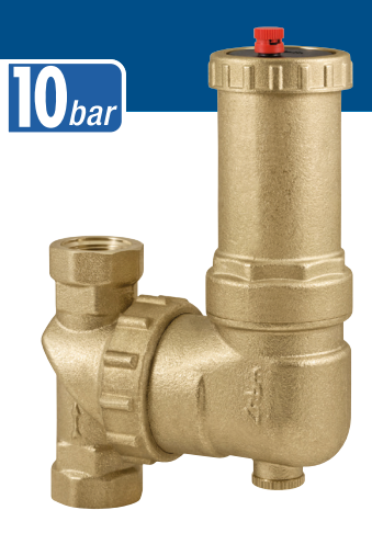
AIRTERM UP Adjustable deaerator